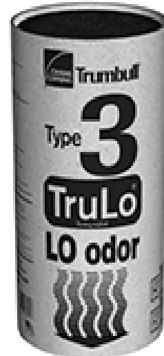
Trumbull Asphalt Joint Sealer