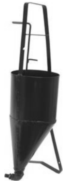
Asphalt Crack Filler Pour Pot