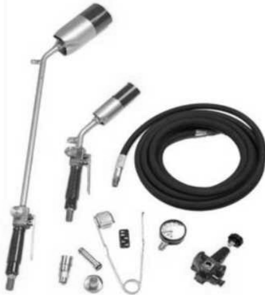
Torch Combo Kit