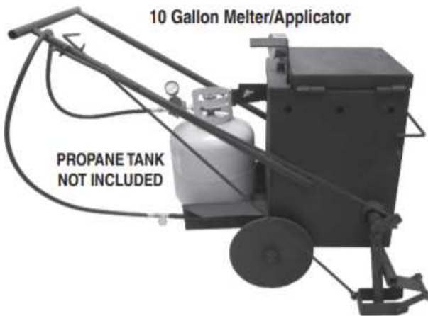
Portable Asphalt Melter/Applicator